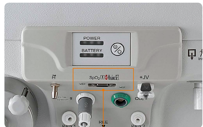
SpO 2 Masimo SET® port

MV350 has an Masimo SET® SpO 2 option. The ventilator is compatible with all types of Masimo SET® SpO 2 sensors.